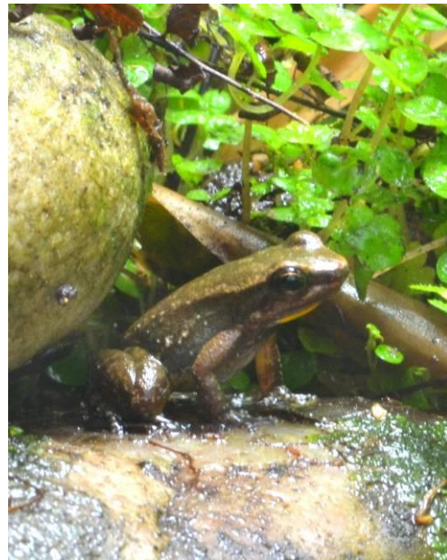
Yellow throated stream frog