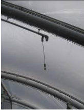
Sprayer Look up.