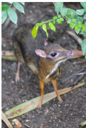
Chevrotain Forest floor. These deer are very small – only about 30cm to their shoulders.