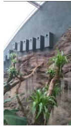
Bird houses Look to the right as you enter.