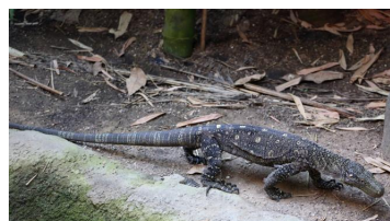
Crocodile monitor lizard In the last room before leaving the building. Not always easy to see. Tends to like the rock ledges on the back wall or on left hand wall.