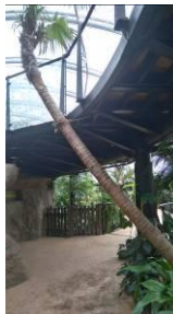
Leaning tree Just near aquarium viewing windows.