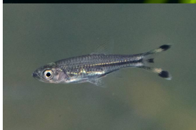
Scissor tail Tail fins open and close like scissors.