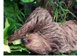
Sloth Look to the left as you enter.