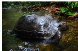
Tortoise Forest floor.