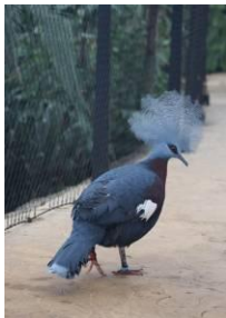
Sclater's crowned pigeon Usually on forest floor, sometimes on path.