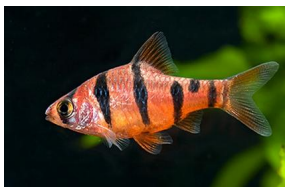
Tiger barb In aquarium. Viewing windows on lower level.