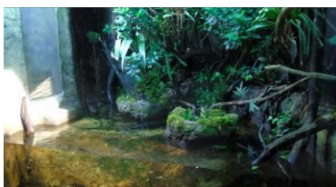
Ants. Can be seen in the darkened Science Gallery but may be better to carry on through doors to view through the 'flooded forest' window.