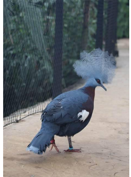
Sclater's crowned pigeon