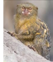
Monkey Island The monkeys (pygmy marmosets) are small – try looking for movement of the leaves to help locate them.