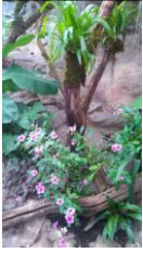
Rosy periwinkle Look to the right as you enter.