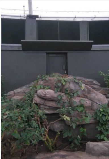
Monkey Island - Pygmy marmoset