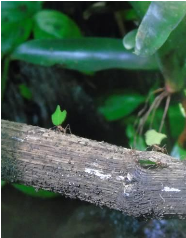
Leaf cutter ants